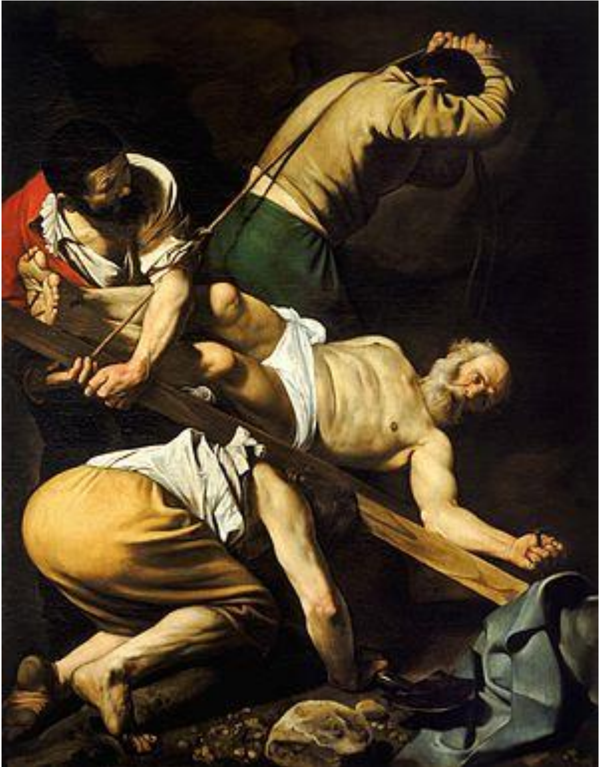
The Crucifixion of St Peter by Caravaggio, (1571-1610)

When they had finished breakfast, Jesus said to Simon Peter, “Simon, son of John, do you love me more than these?” He said to him, “Yes, Lord; you know that I love you.” He said to him, “Feed my lambs.” A second time he said to him, “Simon, son of John, do you love me?” He said to him, “Yes, Lord; you know that I love you.” He said to him, “Tend my sheep.” He said to him the third time, “Simon, son of John, do you love