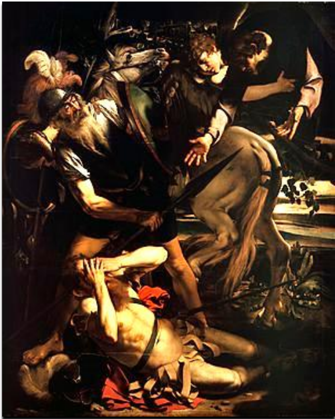
The Conversion of St Paul by Caravaggio (1571-1610)

But Saul, still breathing threats and murder against the disciples of the Lord, went to the high priest and asked him for letters to the synagogues at Damascus, so that if he found any belonging to the Way, men or women, he might bring them bound to Jerusalem. Now as he journeyed he approached Damascus, and suddenly a light from heaven flashed about him. And he fell to the ground and heard a voice saying to him, "Saul, Saul, why do you persecute me?" And he said, "Who are you, Lord?" And he said, "I am Jesus, whom you are persecuting; but rise and enter the city, and you will be told what you are to do." The men who were travelling with him stood speechless,