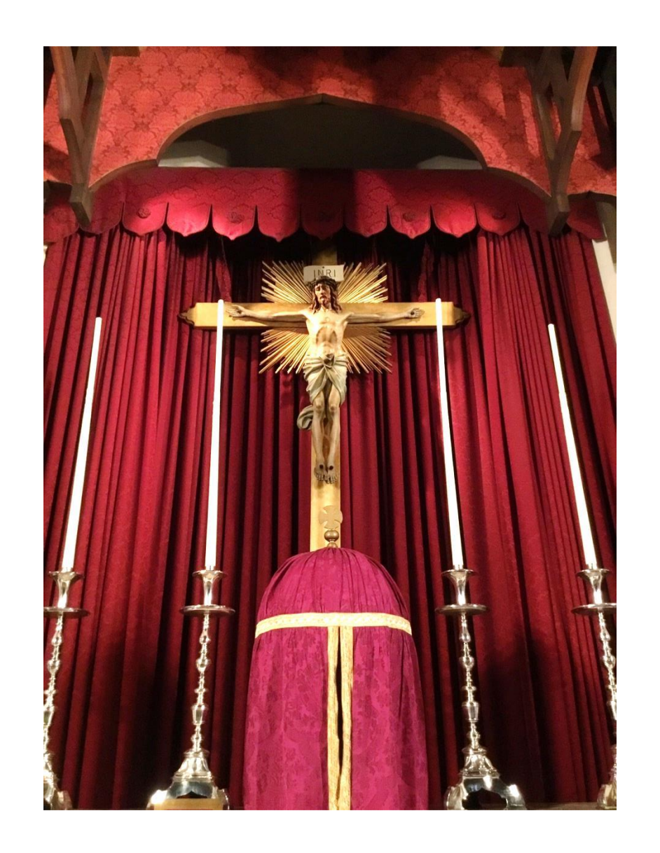
HOLY WEEK & EASTER AT HOME